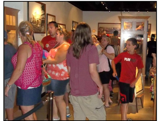
Burger Fest at the museum.