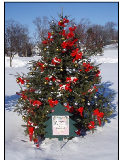
Help light up Depot Street.